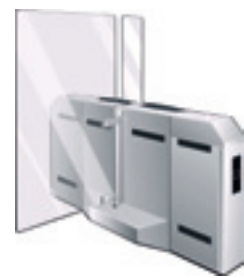
PMD 337 matching PNG 382/392 Footprint*: 2000 x 1255 mm (78 3/4" x 49 2/5")

○ Exists also with Compact Footprint and with Enhanced Entrance Control: PMD 335 matching PNG 380/390 and PMD 336 matching PNG 381/391