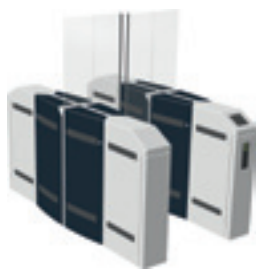
PNG 382 with Enhanced Entrance/Exit Control Footprint*: 2000 x 1270 mm (78 3/4" x 50")