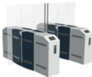
PNG 392 with Enhanced Entrance/Exit Control Footprint*: 2000 x 1870 mm (78 3/4" x 73 5/8")