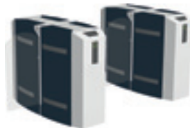
PNG 390 Footprint*: 1270 x 1870 mm (50" x 73 5/8")