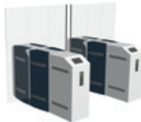
PNG 391 with Enhanced Entrance Control Footprint*: 1635 x 1870 mm (64 1/4" x 73 5/8")