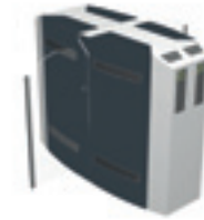
PNG 390 Twin with Compact Footprint Footprint*: 1270 x 1585 mm (50" x 62 1/2")

○ Exists also with Enhanced Control: PNG 391 Twin and PNG 392 Twin