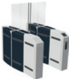
PNG 381 with Enhanced Entrance Control Footprint*: 1635 x 1270 mm (64 1/4" x 50")

○ Exists also with Enhanced Control: PNG 391 Twin and PNG 392 Twin