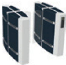
PNG 380 with Compact Footprint Footprint*: 1270 x 1270 mm (50" x 50")